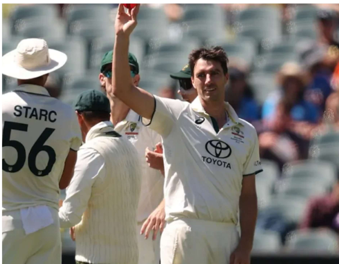
Pat Cummins celebrates a 5fa v India - 2024